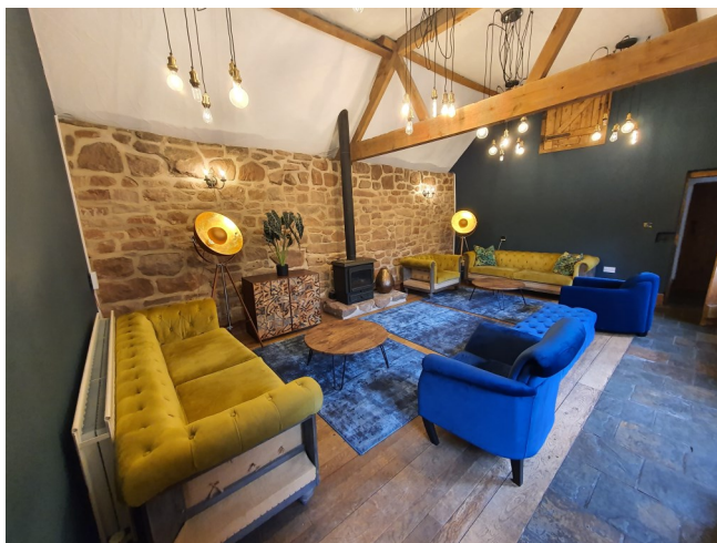
Bayberry Cottages (above), Clouds House (below)

Your choice of addiction rehab centre can be discussed with your lead clinician, but may also be dependent on bed availability at the time of admission.